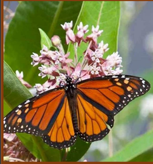
MONARCH BUTTERFLY FEEDING ON A MILKWEED PLANT