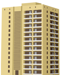
Hi Rise A-part-ments