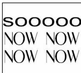
Wuzzle No. 2