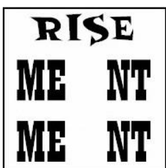
Wuzzle No. 1

WUZZLE PUZZLES - What is a Wuzzle Puzzle? It is a puzzle consisting of combinations of words, letters, figures, or symbols positioned to create disguised words, phrases, names, places, etc. Are you ready to take the challenge and figure out the "disguised" meaning of these wuzzles? Good luck. The answers are available on page of this newsletter.