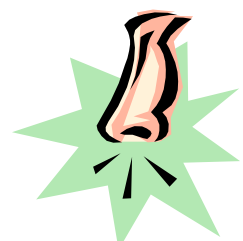
Right Under the Nose