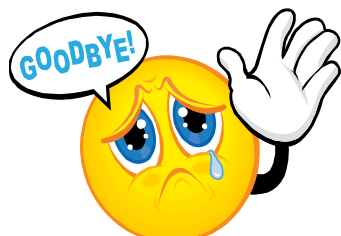
Sooo Long for Now